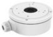
HIA-J101 Junction Box