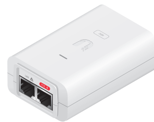
POE-24-24W-G-WH POE-48-24W-WH POE-48-24W-G-WH