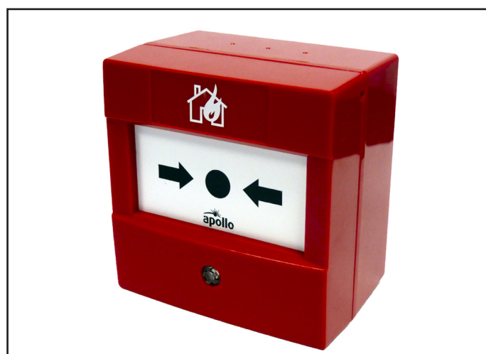
Part no 55200-001 - Conventional Manual Call Point (indoor only, outdoor not shown)