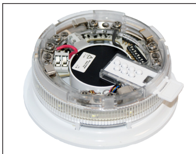
Part no 45681-705 - XP95 Sounder VAD Base with Isolator